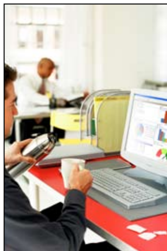
ACT! 2008 adds features and tools that save steps and keep the information you care about close at hand.

gather more detail or to take action on any activity or opportunity immediately. You can copy any Dashboard component or the entire ACT! Dashboard to Microsoft Office applications for use in your e-mail messages, reports, and presentations. Where applicable, the information is presented in graphical form to make it easy to understand at a glance.