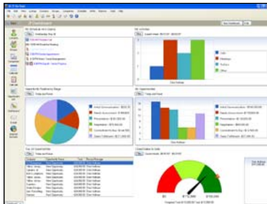
The new ACT! Dashboard delivers the information you rely on during your business day.

When you want a quick look at your top sales opportunities, the Top 10 Opportunities component delivers. Filter for a specific date range or status, or sort each column in the list by name, total, company, and more. You can drill down and take further action on any opportunity, adding details, scheduling a follow-up, or moving it through the sales process.