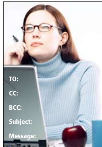
As your email message is sent, ACT! will automatically attach a history record to the ACT! Contact.

In ACT! 2007, you are able to quickly identify