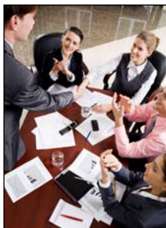
Using Opportunities can help you forecast sales more accurately, and help your sales team achieve their sales goals.

sale, such as: appointment made, demonstration completed, and proposal sent. For each Opportunity, you can track the stage in the cycle, allowing both the salesperson and sales management to get a better feel of when the sale will close.