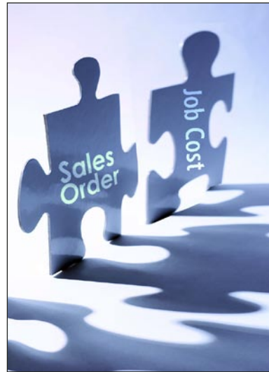
With the Version 4.1 release the Sales Order and the Job Cost modules are tightly integrated.

but out of the way. The Item Description, Warehouse Code, Unit of Measure, Tax Class, and Price Level, for example, could be moved out of the primary grid and into the secondary grid.